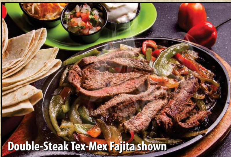
Double-Steak Tex-Mex Fajita shown

Like the classic burrito except with black beans instead of refried beans (inside and on the side) and our veggie mix instead of meat. 18.99